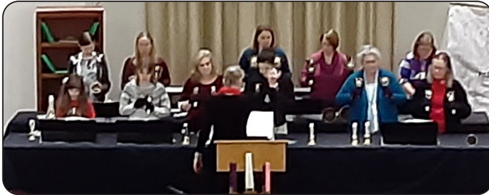
Fairview Loop Baptist Church handbell choir played for worship the week before Thanksgiving and the first three Sundays of Advent.

The staff of the Alaska Baptist Resource Network reserves the right to edit submitted information for content and space.