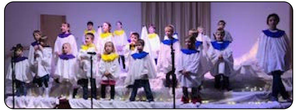
Fairview Loop children's program of December 13 may be viewed online at <a href="https://www.youtube.com/watch?v=cLv30W0caII">https://www.youtube.com/watch?v=cLv30W0caII</a>