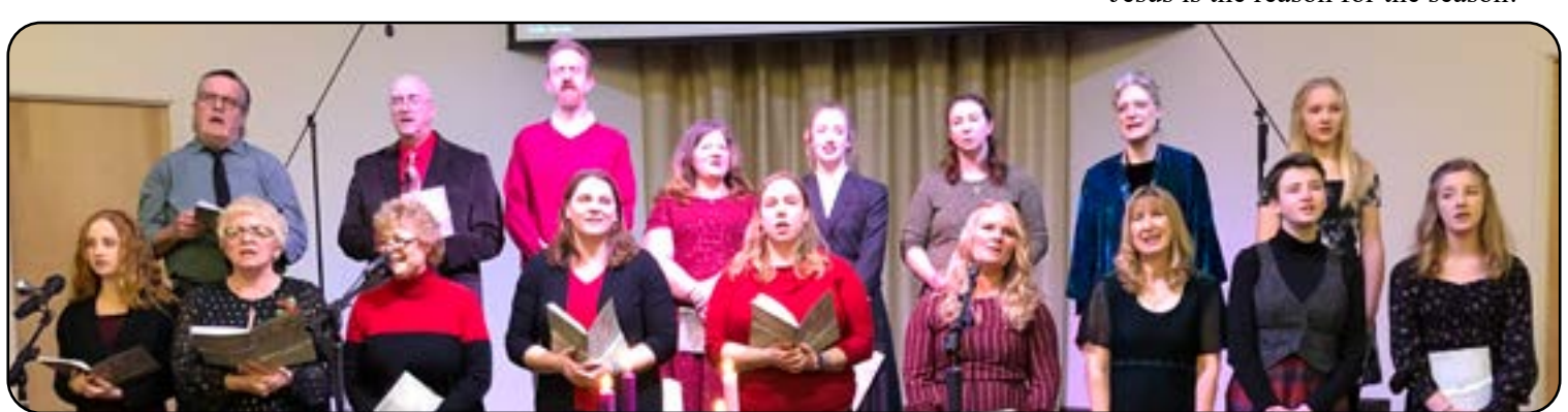
Fairview Loop adult choir program of December 20 may be viewed online at <a href="https://www.youtube.com/watch?v=TqjAoPE">https://www.youtube.com/watch?v=TqjAoPE</a> N9A