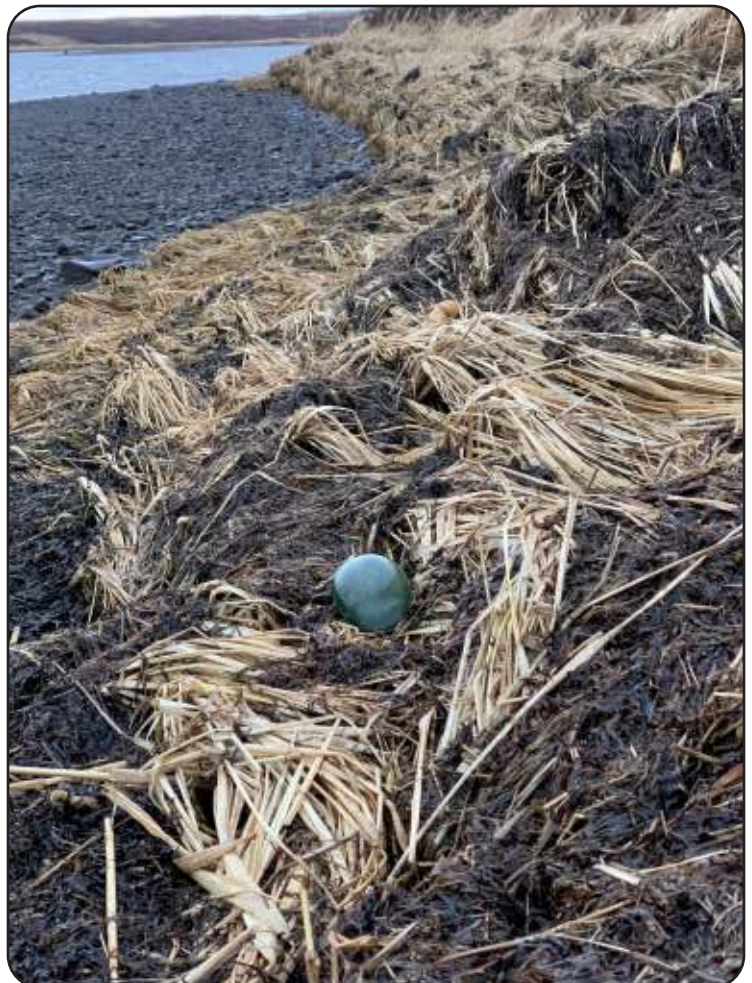
The treasure of a glass ball floated onto the beach in Cold Bay, Alaska

What greater treasure could we possibly seek?