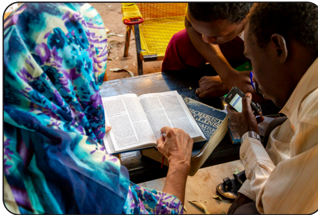
A Christian worker shares the Good News with North Africans.