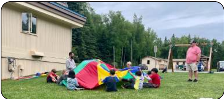
Hillside Baptist Church was blessed with high attendance at their VBS.