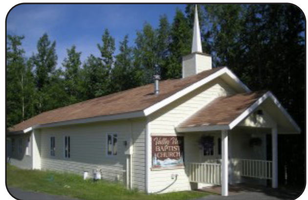
Pastor Needed Valley View Baptist Church Eagle River, Alaska

Shannon Park Baptist Church; 409 Lazelle Road; PO Box 73573; Fairbanks, AK 99707