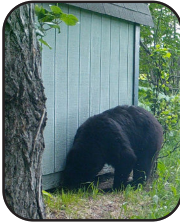
Morning visitor at ABRN, curious about the residents under the shed.