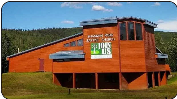
Shannon Park Baptist Church, located in Fairbanks, Alaska, is seeking a bi-vocational pastor.