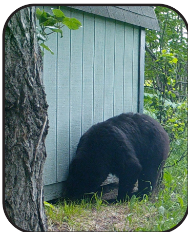
Morning visitor at ABRN, curious about the residents under the shed.