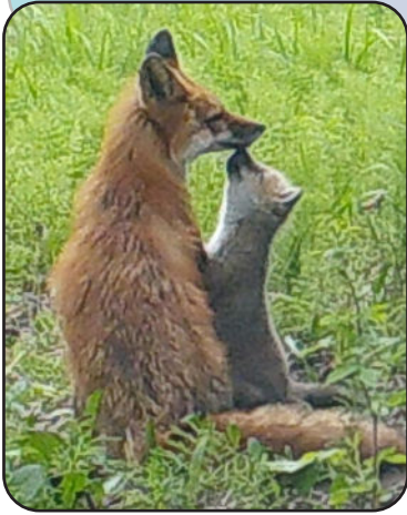
Summer residents at the office of the Alaska Baptist Resource Network, living under the shed.

26-27 ABRN Annual Meeting, Fairview Loop Baptist Church, Wasilla