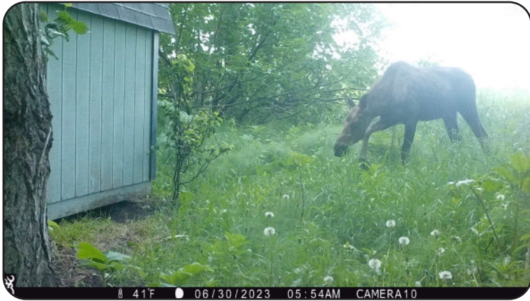
Visiting moose inspects the fox den under the ABRN shed.

Aquillaq Baptist Mission, Ambler Chinese Fellowship, Fairbanks Cross Roads Baptist Church, North Pole First Baptist Church, Soldotna First Native Baptist Church, Anchorage New Grace Christian Church, Anchorage Riverside Chapel, King Salmon Shannon Park Baptist Church, Fairbanks Shungnak Baptist Mission True North Church, Girdwood Valley View Baptist Church, Wasilla