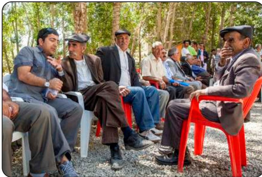
Zaza men chat after a wedding celebration. The men often gather and visit throughout the day of the wedding at the home of the groom. The Zaza are a people group who live in Turkey.

Josh’s name has been changed for security reasons.