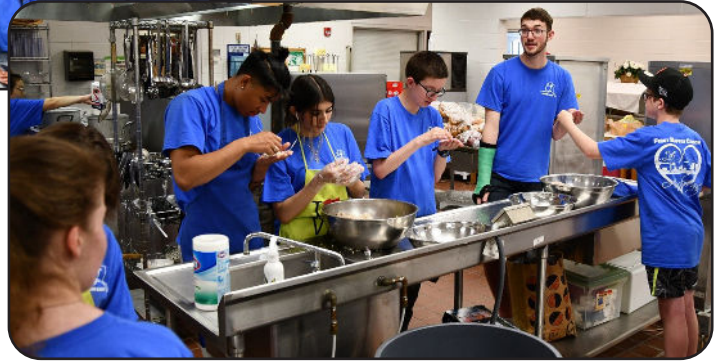
Eskimo Ice Cream prep team