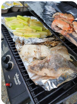
The prepared meal