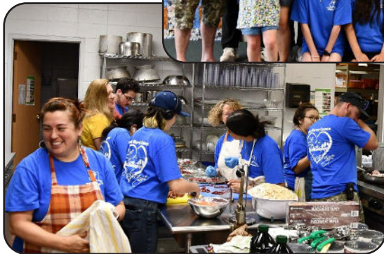
salmon prep team