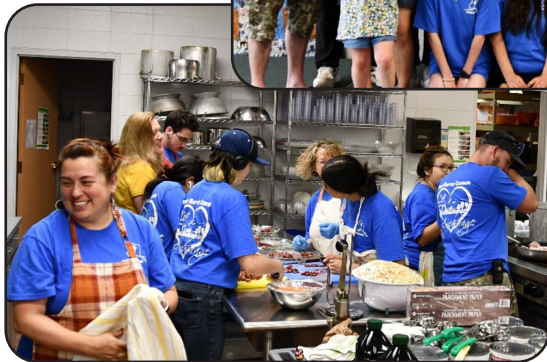
salmon prep team