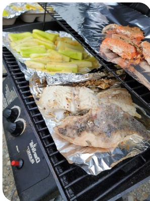
The prepared meal