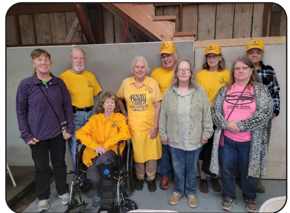
The trainees with trainer