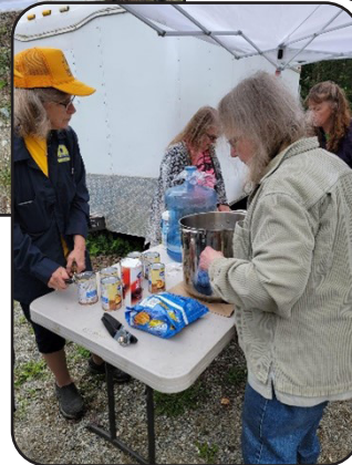
The cooking process