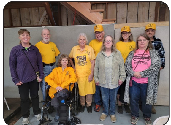
The trainees with trainer