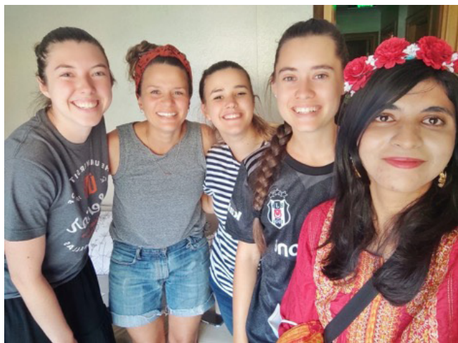
A cohort of Fusion students served in Central Asia this summer. The students built a relationship with a local friend and were able to share the gospel with her. The girls ask for prayers for their friend to respond to the gospel messages.

He continued, “Fusion students are being trained to work together to reach unreached people groups and IMB has a very clear focus on accomplishing the missionary task among every people in the world. As we train up Fusion students to make disciples for the rest of their life, it would make sense that we partner with people who are dedicating their entire lives to that very same task.”