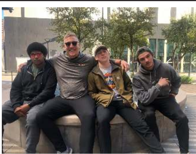
Students from the 2021-2022 Fusion season. Fusion is a program for college students through Spurgeon College.

be something that solidifies that for them."