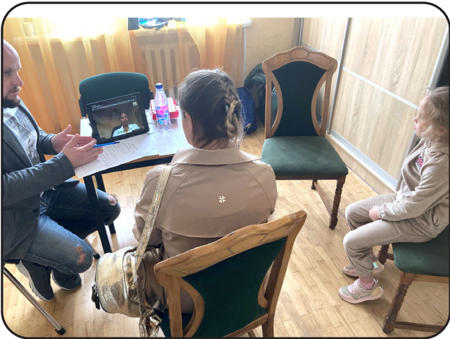
Patients in Ukraine consult with doctors from the United States via telemedicine kits at a clinic set up by national believers.

His heart sounds stable. That's a good sign. Next, a nurse next to the patient in the clinic holds an otoscope to the man's ear. A live video of the veiny, flesh colored ear drum appears on her screen in the U.S.