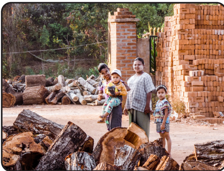
Two mothers and their children pause for a photo. Many families are hearing the gospel for the first time in a Southeast Asian village where IMB workers are sharing the gospel

into our living room and shared the gospel with my brothers and me. I'm thankful for that same pair of feet that put on a pair of old wading boots and walked down into a baptistry to baptize my two brothers and me. You'd have an IMB president regardless but, if not for those feet, you wouldn't have this one.