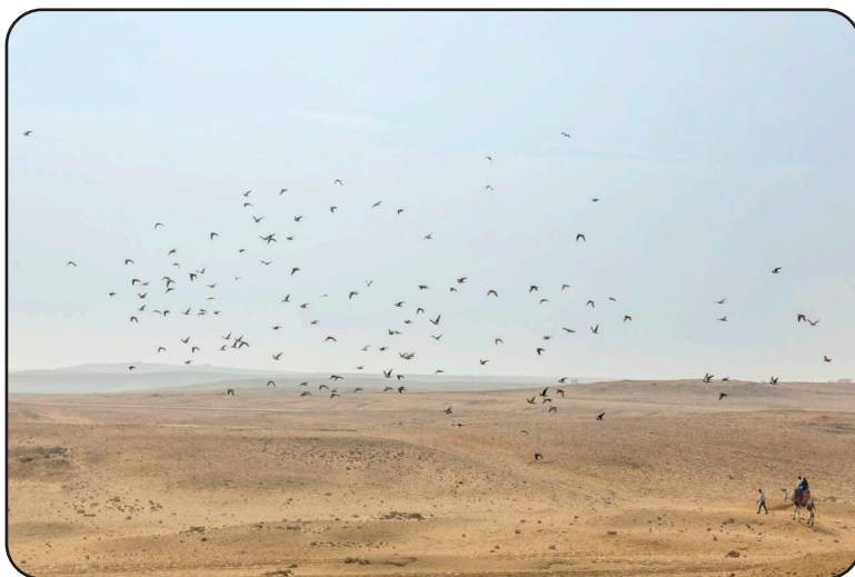
A couple rides a camel in the desert outside of Giza, Egypt.

Rory Bennet serves with the IMB among North African and Middle Eastern people groups.