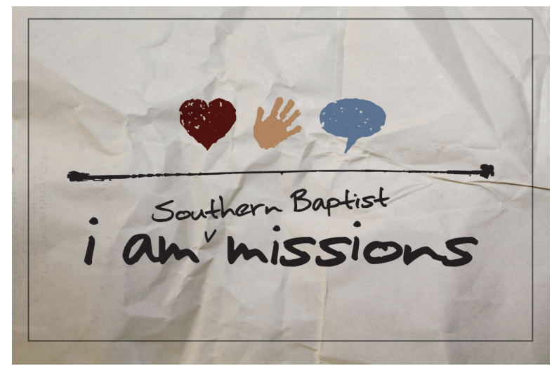
2011 Lottie Moon Christmas Offering® State Goal: $150,000 Week of Prayer for International Missions: December 4-11, 2011