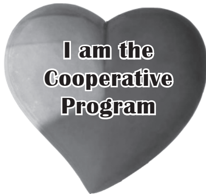
Jimmy (Kathryn) Stewart Alaska Baptist Convention