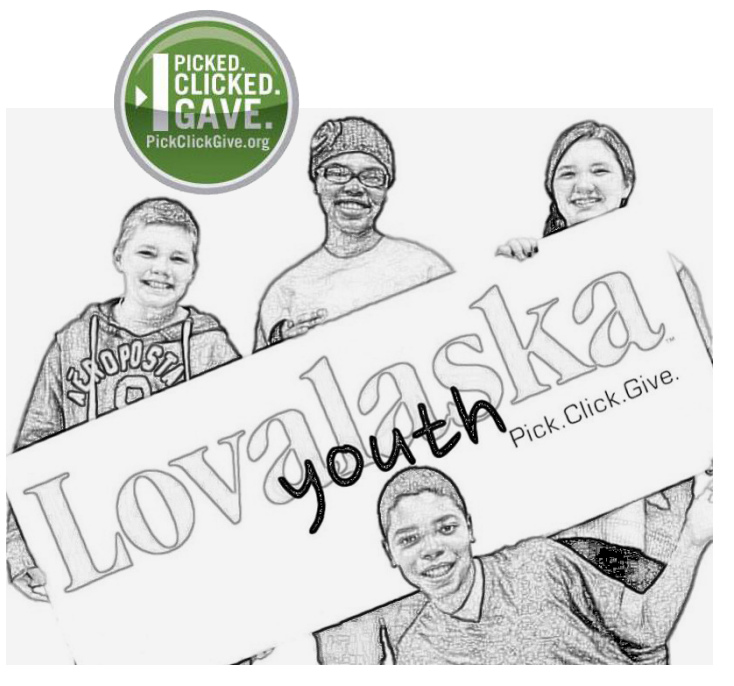
Please remember Alaska Baptist Family Services!

Anchorage Delta Junction Eagle River Fairbanks Juneau Kenai Ketchikan Kotzebue North Pole Palmer Petersburg Soldotna Sitka Valdez Wasilla Willow Anchorage Anchorage Anchorage Fairbanks Kodiak Anchorage Juneau Anchorage Anchorage Palmer Anchorage Hoonah