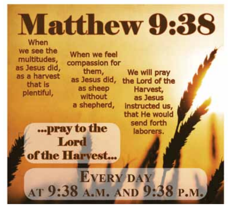
Alaska Baptist Convention