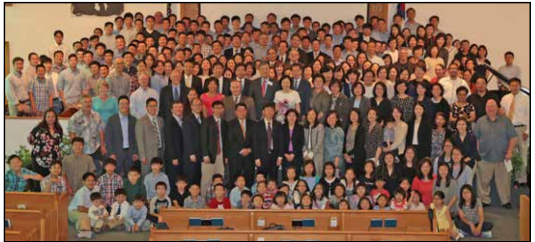
Attendees of the inaugural service at Frontier Baptist Church!