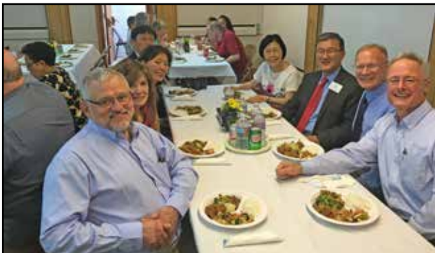
Celebration lunch after the service.