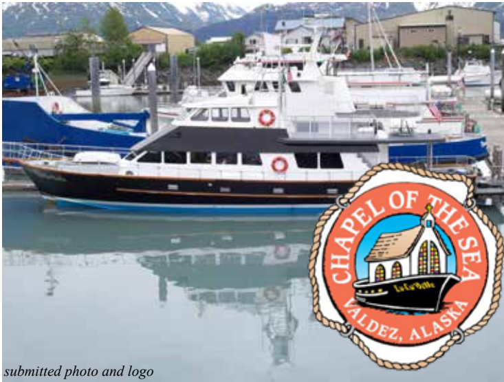
submitted photo and logo

The staff of the Alaska Baptist Convention reserves the right to edit submitted information for content and space.