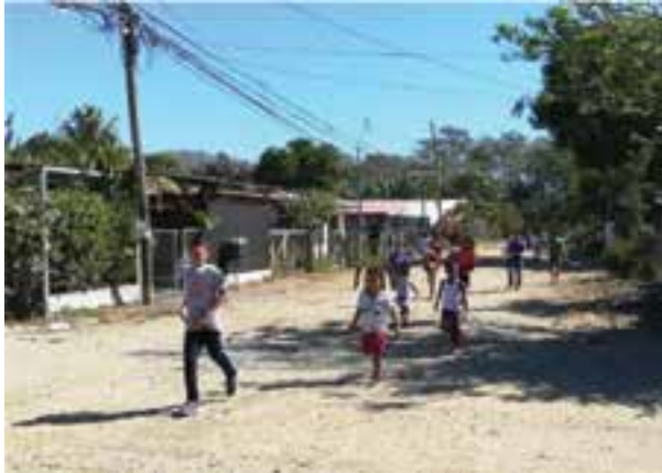
Children running for the bus to VBS

with 125 children reached. The first day started a little rough. The electricity and water went off in the local com-