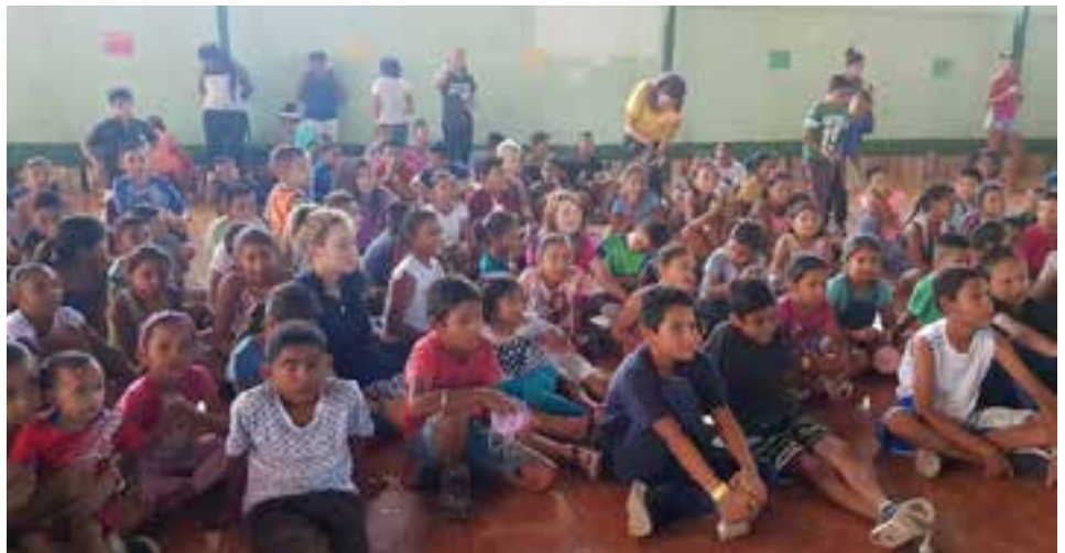
VBS group time