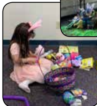
Child enjoying her Easter basket.