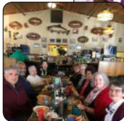
Guest speakers and Leadership Team at lunch