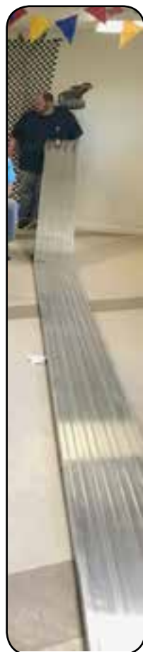
Grand Prix Race Track

The others began adding beads to the cloth purses we brought for them to decorate. When the evening ended the girls invited us to return with the understanding that they would teach us to crochet. We all had a great time.