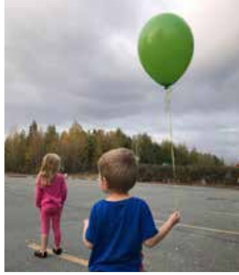
Grandview Baptist Church had a great Carnival Kickoff! Children from the church and surrounding community came together and played games, ate nachos, and had a blast! The laser tag and bounce house were the favorite attractions. Children participated in a trash to treasure contest, building something cool out of recycled items. We discussed how God can take the "trash" in our lives and do something beautiful if we are willing. We look forward to a great semester of DELTA Kids!