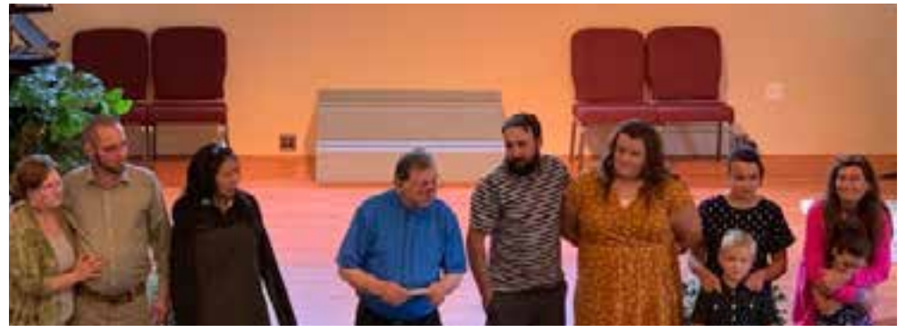
<u>Montana Creek Baptist Church</u> celebrated Baptism Sunday, September 8, with four baptisms, one coming to be baptised later, and nine additions to the church.