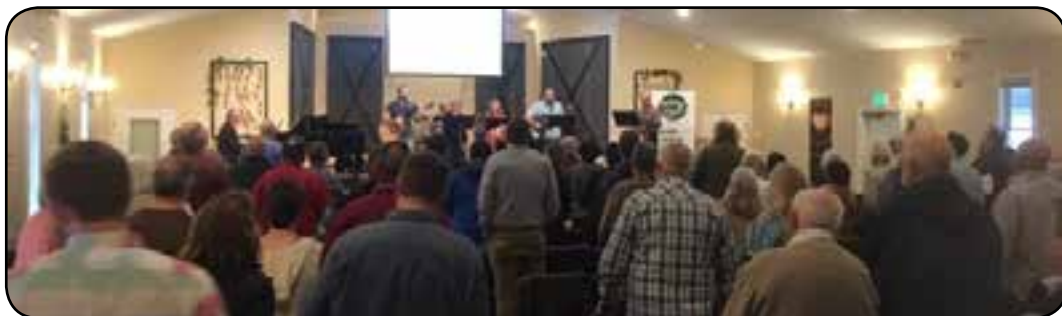
the Church in worship