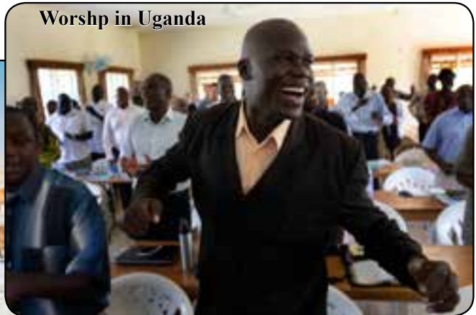
Worshp in Uganda