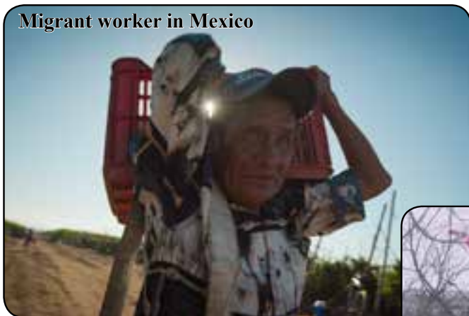
Migrant worker in Mexico