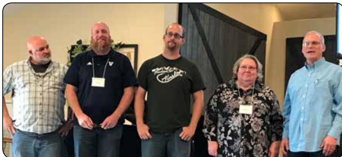
2019-2020 Officer installation: