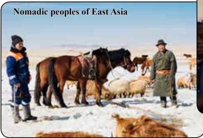
Nomadic peoples of East Asia