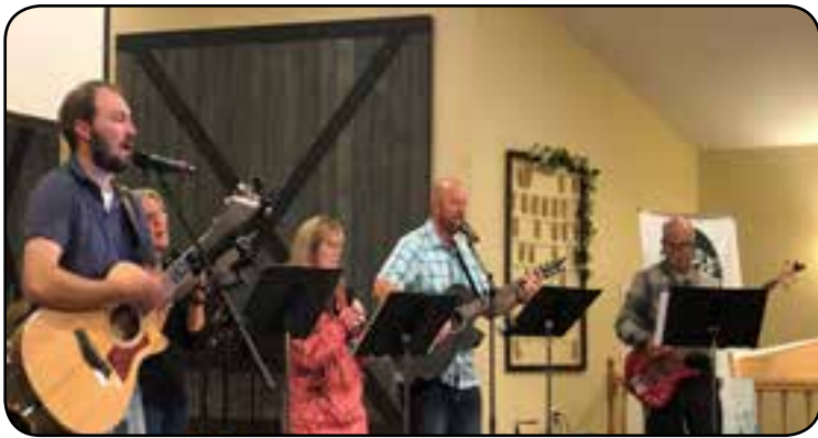
College Heights worship team