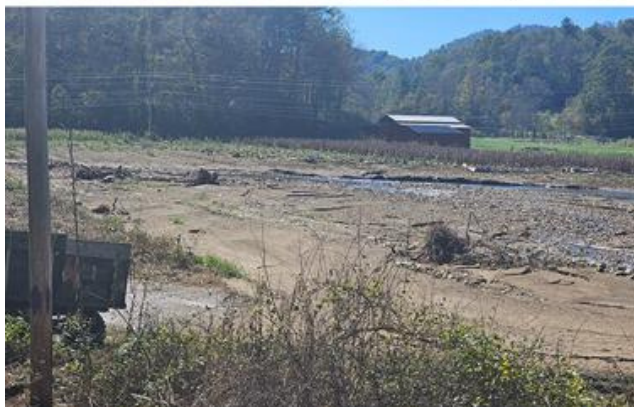
Before the flooding and after Helene flooding in Yancey County, North Carolina.