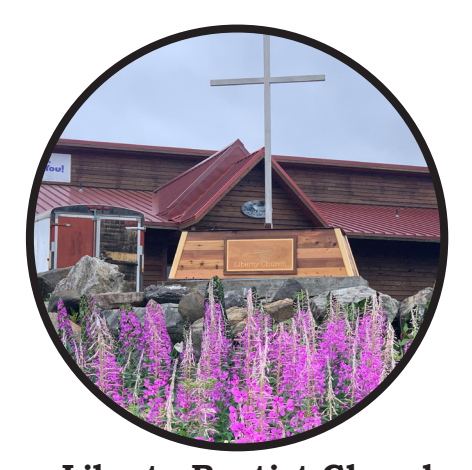
Liberty Baptist Church Craig, Alaska

Liberty Church has completed its building project this week and we are excited to see the new worship center get filled. Our church has been growing at a steady pace with new faces almost every Sunday. The school district had to cancel their summer lunch program due to staff shortages. Our church jumped into action and quickly developed a program to replace it. We fed between 68 and 79 kids every Monday, Wednesday and Friday. This has been a huge ministry and the entire community has come together to support the Lord's efforts. We distributed school supply backpacks to all the kids on Prince of Wales at the end of the July, and had a great turnout to our sports camp, and VBS. We had a grand opening extravaganza on the 4th of July where we fed the island residents and provided games and fun events for everyone. Our leadership team has been growing as the Lord continues to equip us to reach our community.