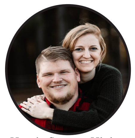
Mosaic Campus Ministry

Our primary objective is to Help Students Know Christ. We want to LEAD college students and others in the academic community to faith in Jesus Christ, CONNECT them to like minded believers and to the local church, DEVELOP them as disciples and leaders and TEACH them how to live a MISSIONAL lifestyle.